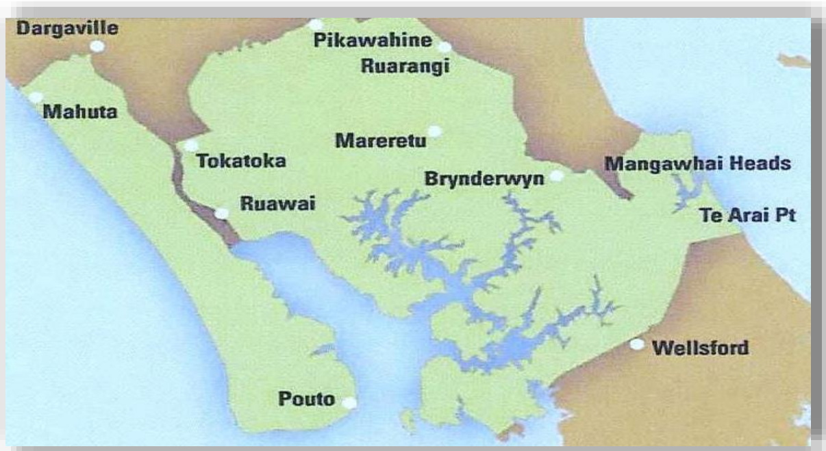
Table 1.1 Te Uri o Hau Estates and Territories: Statutory Area of Interest