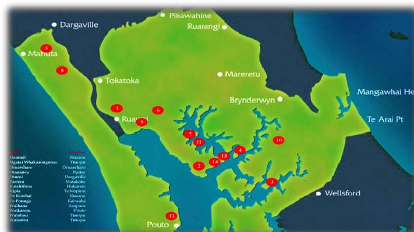
TABLE 3.5 | NGA MARAE O TE URI O HAU