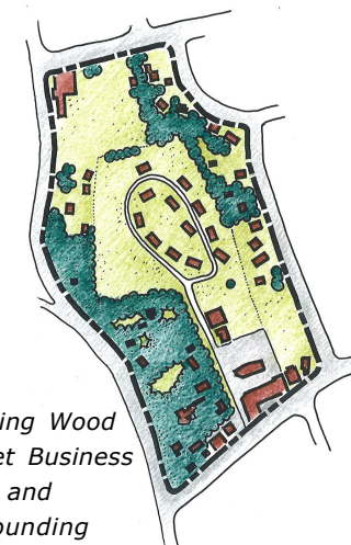
Existing Wood Street Business area and surrounding residential activities within their dominant open space setting