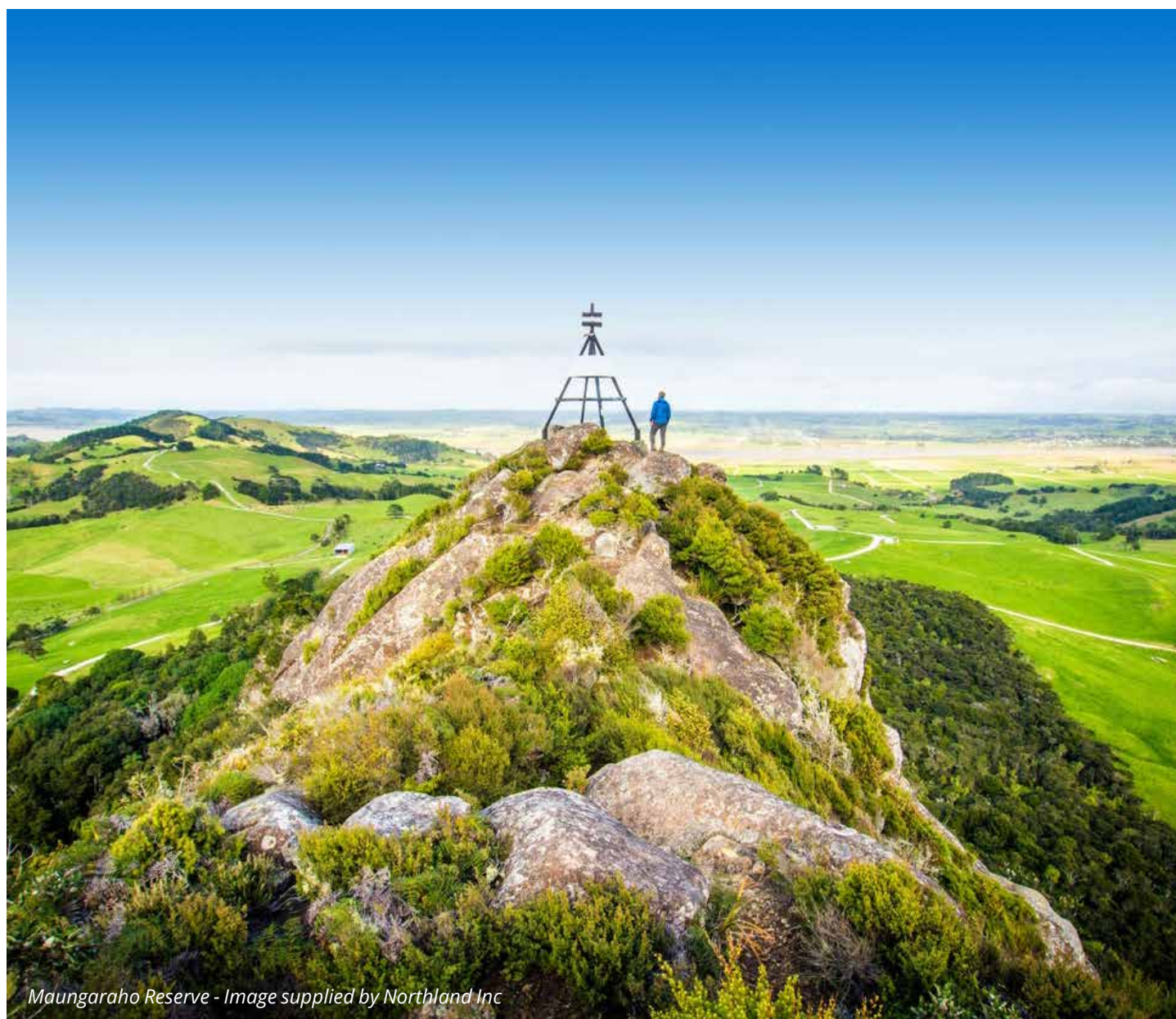
Maungaraho Reserve

Kaipara District Council (Council) is required by the Local Government Act 2002 to provide a Local Governance Statement following each triennial election. This statement provides information about the processes through which Council makes decisions, engages with the residents of Kaipara, and how the community can engage and influence those decisions. It also supports the purpose of local government by promoting local democracy.