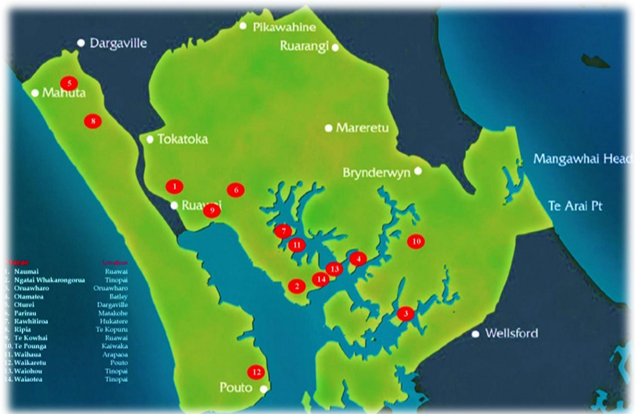
Plate 3.1: Nga Marae o Te Uri o Hau