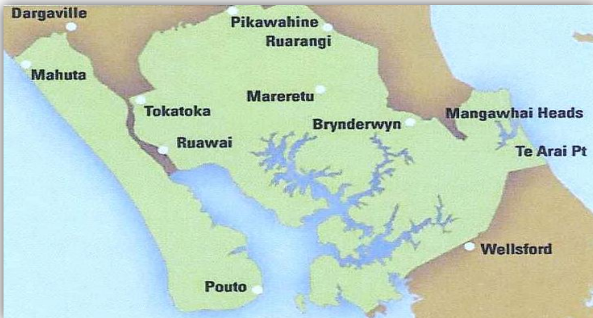
Plate 1.1 Te Uri o Hau Estates and Territories: Statutory Area of Interest