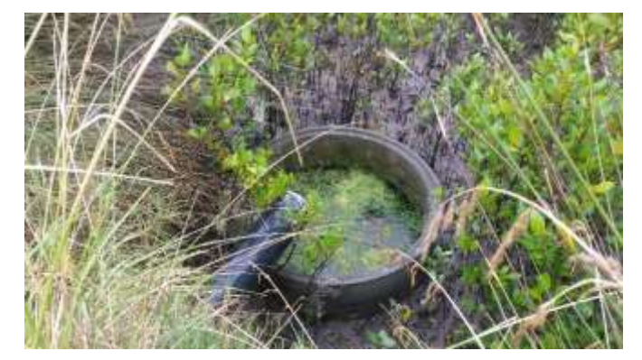
Gordon Street Dargaville