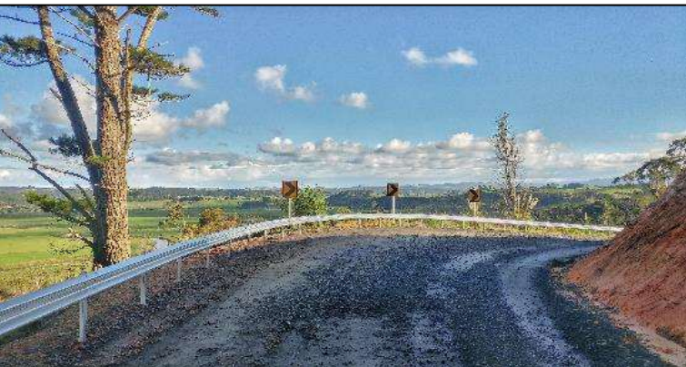
New retaining structure on Arcadia Road