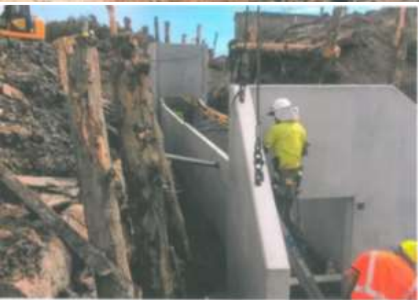
Works carried out to undertake replacement of Floodgate №38 on Te Kowhai Floodgate Road