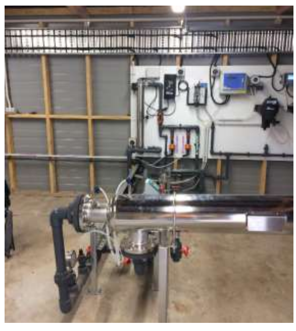
Mangawhai Water Treatment Plant