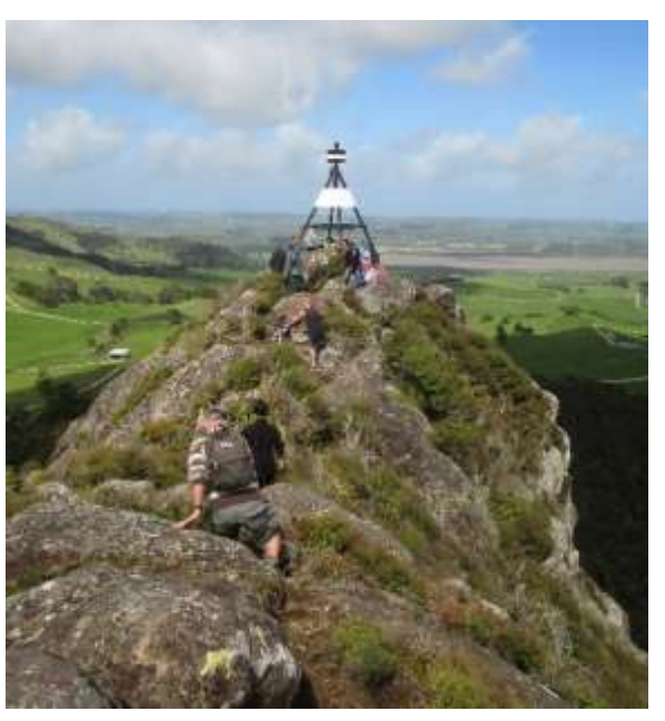
Summit track at Maungaraho Rock was reopened