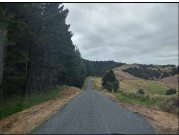
Ounuwhao Road – Before and after heavy metal overlay