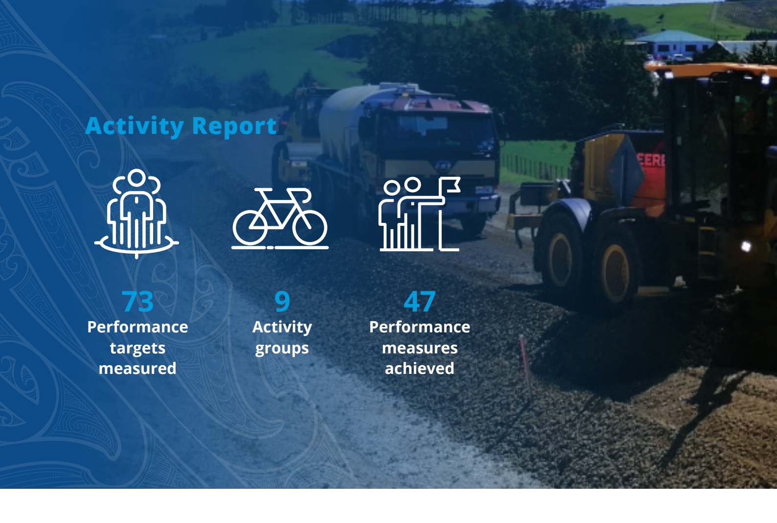
"Of the 73 performance measures, 47 were achieved."