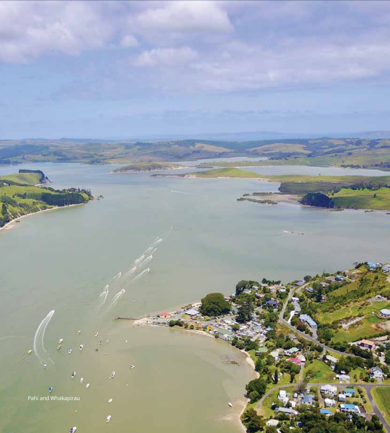
Pahi and Whakapirau