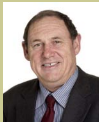
Mayor Neil Tiller